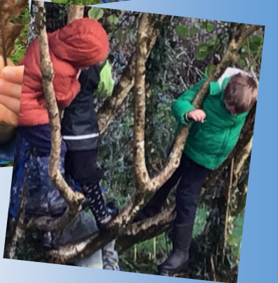
A nature walk in the woodlands for Praa Sands Class