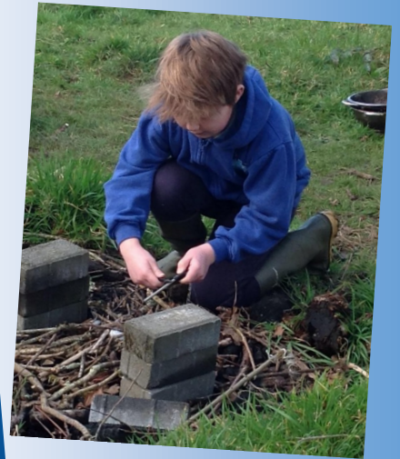
A Woodlands Session for Godrevy Class Godrevy class had a very interesting and enjoyable morning during their woodland session. They made fires cooked pancakes and practiced their whittling. Thank you Mrs Ash for your expertise, help and support on the day.