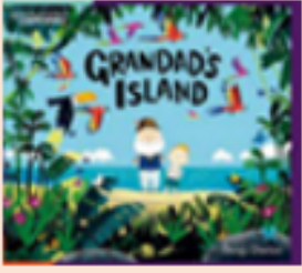
Grandad's Island - Benji Davies.